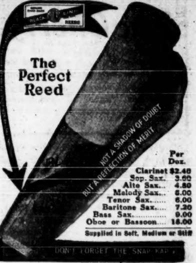
J. SCHWARTZ MUSIC CO., Inc. 10 West 19th Street, New York, N. Y.

BARTER SYSTEM TO AID UNEM PLOYED-A scrip warehouse plan is to be used in Jackson County, Oregon, this winter as a measure of relief for the un-In effect, it is barter as a medium of exchange. The base of the plan is exchange of labor for farm produce and foodstuffs. As outlined, the farmer in need of fall work takes produce to a central warehouse. A committee sets a market value on the produce and pays the farmer in scrip good for labor at a moderate wage. Men working for the farmer are paid in the scrip and