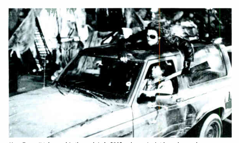
Kurt Russell takes a ride through L.A. 2013 a.d.—not a lot has changed.

immoralists and/or other criminals, doesn't give it a helluva lot of differentiation than it is today. Well, maybe a little more rubble on the streets, but the locals?...just look out your window.