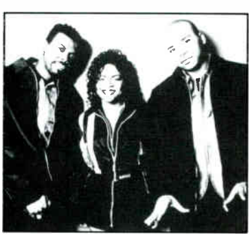
Quad City DJ's

. . . . . . . . . A Tribe Called Quest DEBUT