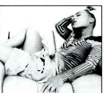
High Debut: Me'Shell