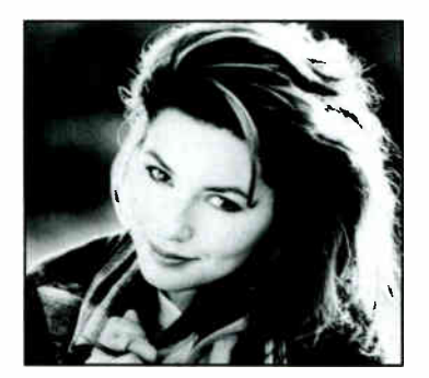
This Week's #1: Shania Twain