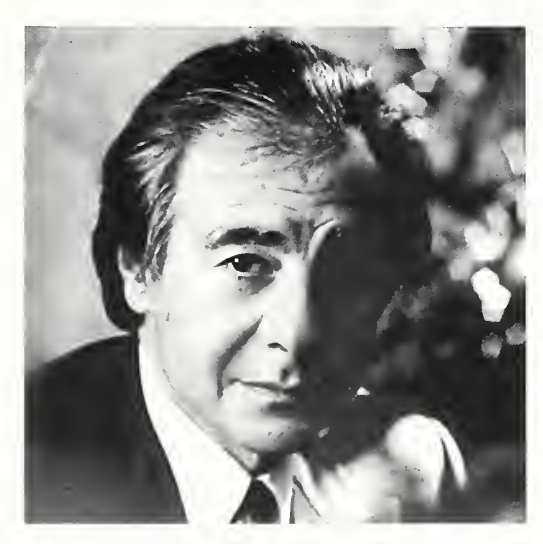
Lalo Schifrin in bloom.

"I didn't try to prove anything," Schifrin says. "But I knew they had something in common."