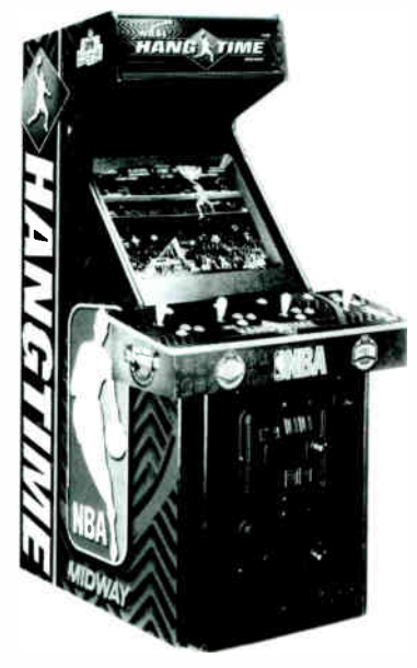
Midway's Hang Time

CHICAGO — Midway Manufacturing Company is now offering the latest in its series of NBA-licensed basketball video games—NBA Hang Time. The game, which was designed by the same team that produced NBA Jam and NBA Jam Tournament Edition, features 2-on-2, full-court basketball action between players right off the rosters of National Basketball Association teams.