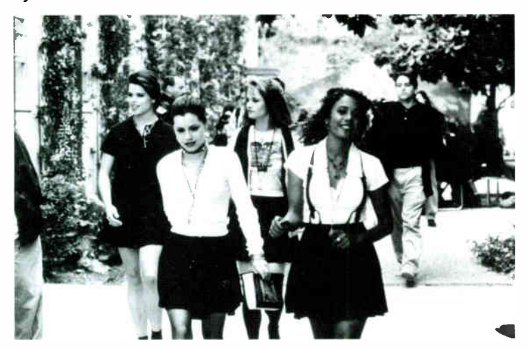
Four high school witches, Neve Campbell, Fairuza Balk, Robin Tunney and Rachel True (I-r) stride campus with power.

SCENARIO: INT. - WRITER'S ROOM - (D/N) WHENEVER—Cliché decorations. Pla-Time basketball hoop. Foam rubber b'ball tossed at it. Pinball machine in one corner. Sleeping bags on floor. Playboy centerfolds on ceiling. Dart board on door. Everything except paper, pens, pencils, typewriters, computers.