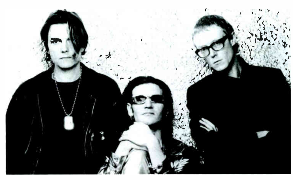
Love and Rockets

"It's hard to accept that a band that made a lot of great records can take a break, for whatever reason, and then everyone will thumb their nose at them in a weird way. I remember when [Love and Rockets' 1988] Earth Sun Moon came out, it was #1 on the CMJ chart longer than any other artist. I remember how much people were into them. And I thought it was so cool for them to