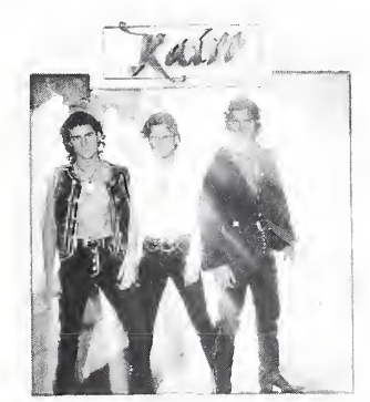
Que La Amo.'