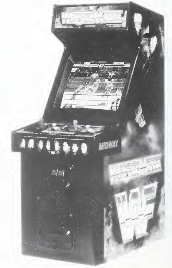
Midway's WWF Wrestlemania