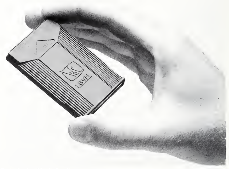
'Party Jockey Music Card'

CHICAGO—Clarion Sales Corporation, headquartered in Gardena, California, recently introduced its Party Jockey karaoke system, featuring a Pocket Music Card which contains a wide variety of music selections for consumer or commercial use.