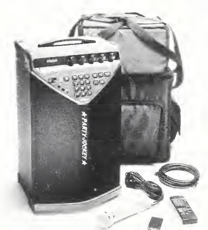
Clarion's Party Jockey System