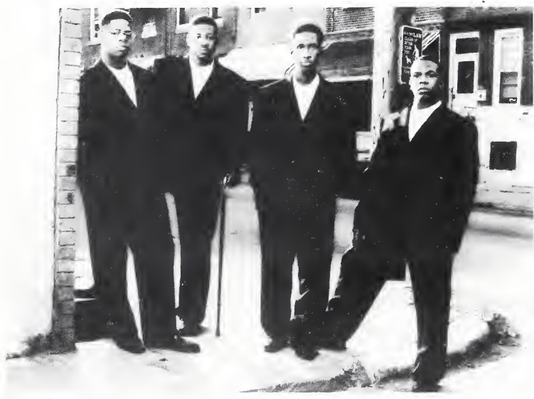
Boyz II Men

Only two of the three acts showed, with TLC bowing out, reportedly due to one of the trio's singers becoming ill.