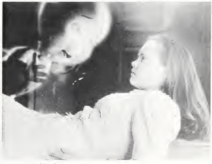
Caspar being friendly.

The little ghost who just wants to make friends was a pleasant memory while attempting to cross town where there are far more frightening apparitions haunting Hollywood Boulevard on far more frightening clouds.