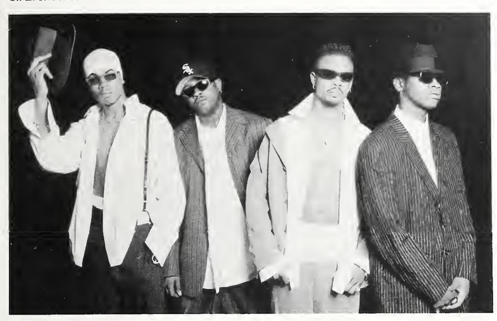
Jodeci: Buckwild and Platinum

THEY'RE BAAAACK! We're talking about those church goin', good 'ole southern boys who sing hit songs about freaks and doin' it. The members of Jodeci are back on the music scene with a new disc that should once and for all settle the debate over which group is the best and the baddest in the highly competitive new jack R&B male group arena. The group's new Uptown/MCA Records disc, entitled The Show, The After Party and The Hotel, is a collection of R&B gold nuggets that are destined to sate the apetite of their large urban following, and perhaps earn them a piece of the pop market. Expectations for this project are high, Virgil Simms, Uptown's vp of marketing says the label is geared to go the distance with the record and confidently predicts 3-4 million units sold when the disc completes it's initial commerical run. "Out of the box this disc has out performed every other release in the history of Uptown Records," Simms told Cash Box. "From week one, the first single, 'Freak'N You', has been the most added song at urban radio, while at retail it's raked in more then 197,000 units. From the promotional and marketing strategies that we have planned, we are confident that the product will continue to perform well for many months to come."