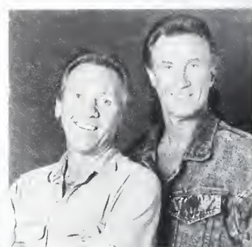
The Righteous Brothers