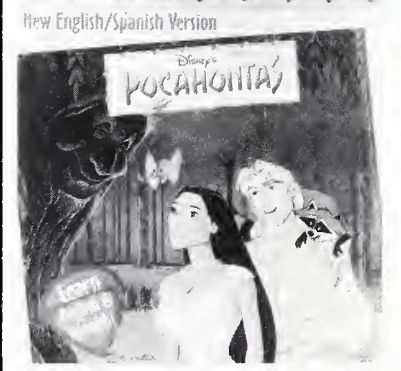
Walt Disney's Pocahontas Read-Along.

Walt Disney Records currently distributes Spanish language versions of more than 20 classic Disney music albums and Read-Alongs including La Bella y La Besta