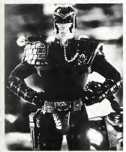
Sylvester Stallone as Judge Dredd.

A BRAIN TEASE: How can a movie, which starts with the script, have one of the worst screenplays ever written, and still be entertaining? And the answer isn't a silent movie, that's too obvious. The correct solution is spend $80 million on effects, feature a lot of attractive people, a boatload of explosions, a bitchin' futuristic set and look like a virtual reality ride. Hollywood Pictures' Judge Dredd, based on the popular British comic book, represents all that's wrong with modern filmmaking. The characters aren't drawn out, the dialogue is absurdly bad, featuring one bad judge pun after another, and the acting, especially Sylvester Staloon as the