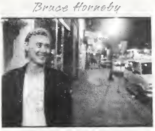
Walk In The Sun

McLennan is best known as the lead singer of the Go Betweens, a very hip pop/folky college band. The Go Betweens are a band that everyone thinks they've heard of, but don't know from where. Let's hope a similar fate doesn't await this grand pop tune. Catchy in that same pop/folk vein, "Lighting Fires" should benefit from strong Triple A support, as well as a promotional push the Go Betweens often lacked.