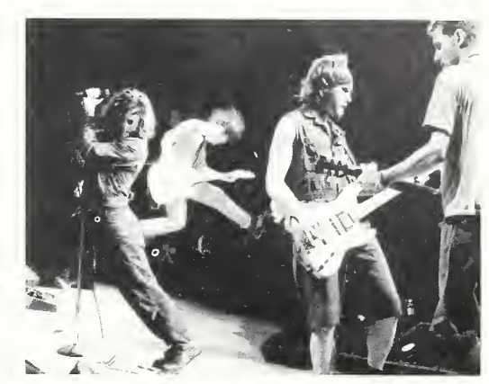
Pearl Jam during more lively times.

Pearl Jam have been the top-selling rock band in America this decade, but their live problems may eventually come back to bite them. They are already experiencing a