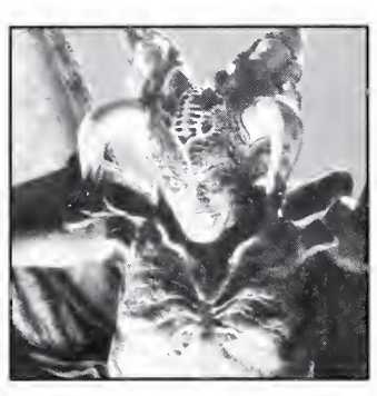
High Debut: Tales Fron The Hood Soundtrack