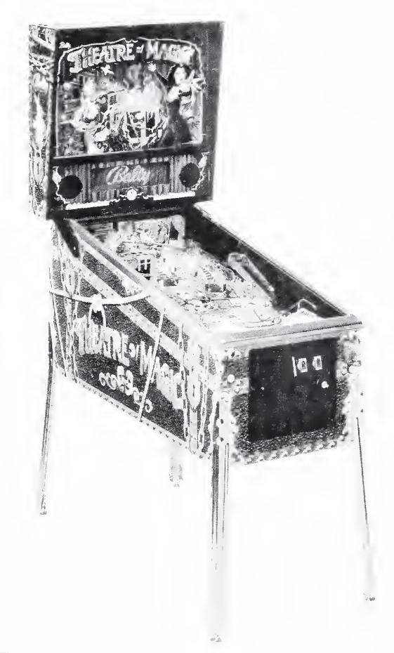
Bally's Theatre Of Magic

Further information about this exciting new pin may be obtained through factory distributors or by contacting Bally/Midway at 3401 N. California Ave., Chicago, IL 60618.