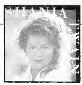
HIGH DEBUT: Shania Twain #37