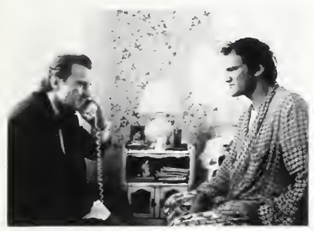
The papa of Pulp , Quentin Tarantino (r), performs with Harvey Keitel (I) in his high-powered three-hat turn for Miramax.

PULP FICTION IS DE-SIGNED just the way its title inspiration-those wonderful soft paper noir packages that contained concoctions by Dashiell Hammett, James M. Cain and Raymond Chandlerused to be; colorful, lurid and slightly (but only so by present middle-class standards) implausible. It could also be subtitled: The philosophical observations on the world according to