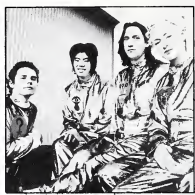
HIGH DEBUT: Smashing Pumpkins