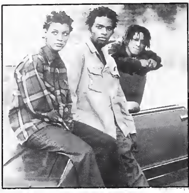
TO WATCH: Digable Planets