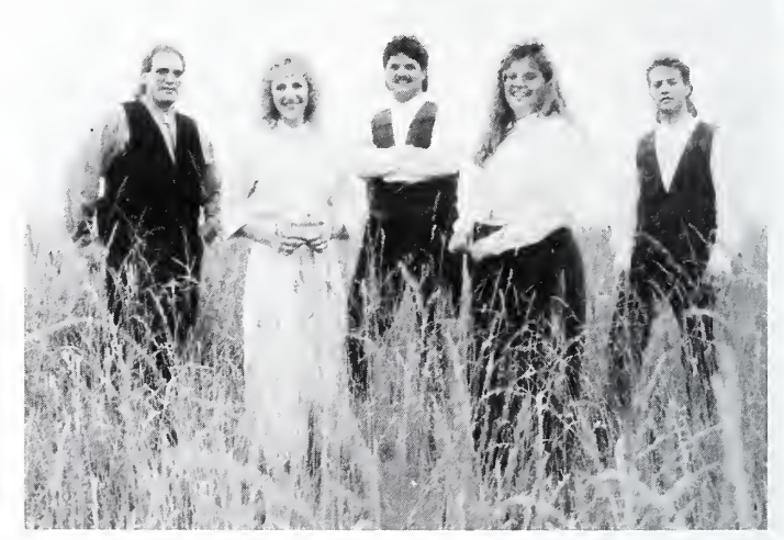
SOUTHERN CHAPEL: "There's A New Man" (Windfall)

Southern Chapel's first release on Positive Country CDX Volume 10 looks like a real winner. This exciting new group gives us a touching ballad with a superb country sound. Look for them to rise to the top in Positive/Christian Country music.