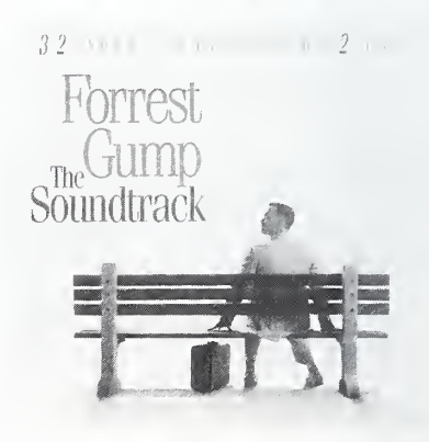
King of the Forrest?