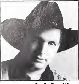
#1 SINGLE: Garth Brooks