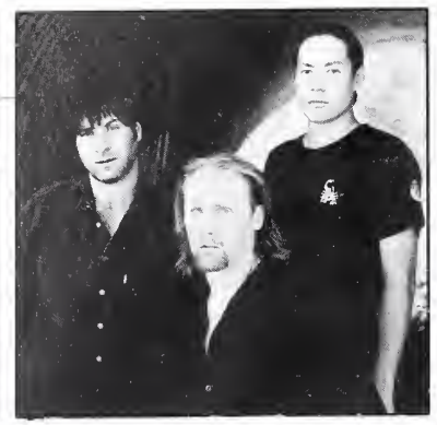
TO WATCH: Big Head Todd