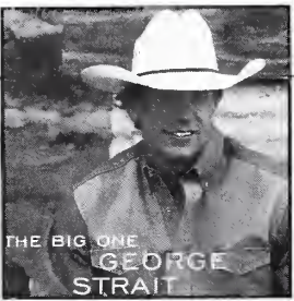
TO WATCH: George Strait #27