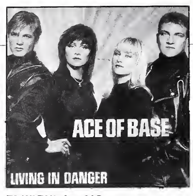
TO WATCH: Ace Of Base