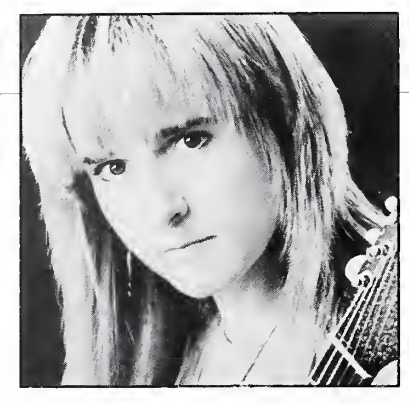
TO WATCH: Melissa Etheridge