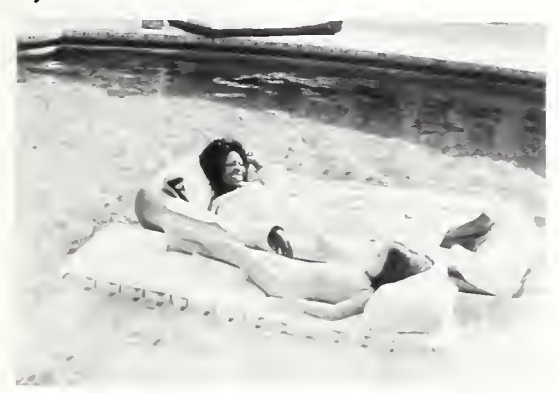
Whoopi Goldberg and Tina Majorino float through another

LOVE AND CARE COME IN ALL sizes, shapes, colors and degrees, and the effect that pair of felt intangibles have on the recipients is incalculable. And it's interesting that when adults become aware of the care, they express their gratitude with a gift (initially anyway),