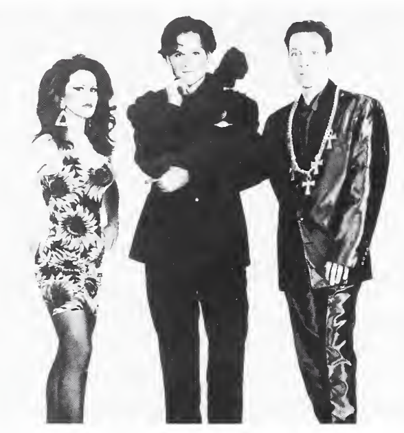
In-fighting over The Flintstones: the BC-52's hit a hot property

ALL IS NOT WELL IN BEDROCK: The dispute between MCA Records and Arcade Records over the album entitled Yabba Dabba Dance caused mayhem to retailers last week. MCA demanded that the album be removed from the stores and threatened legal action against any retailer who did not conform. The album in question has since been banned by the High Court. MCA first secured a restraining order 10 days before over the inclusion of the BC-52's hit "Meet The Flintstones," which the major says it never gave permission to include on the compilation album.