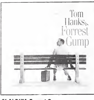
#1 ALBUM: Forrest Gump Soundtrack