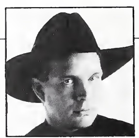
TO WATCH: Garth Brooks #30