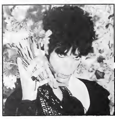
TO WATCH: Prince