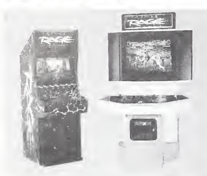
Atari's Primal Rage

CHICAGO—Atari Games (now known as Time Warner Interactive) has introduced an exciting new fighting game called Primal Rage , which offers head-to-head action and an innovation called stop-motion, which brings realism to new heights.