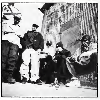
HIGH DEBUT: Bone Thugs -N- Harmony