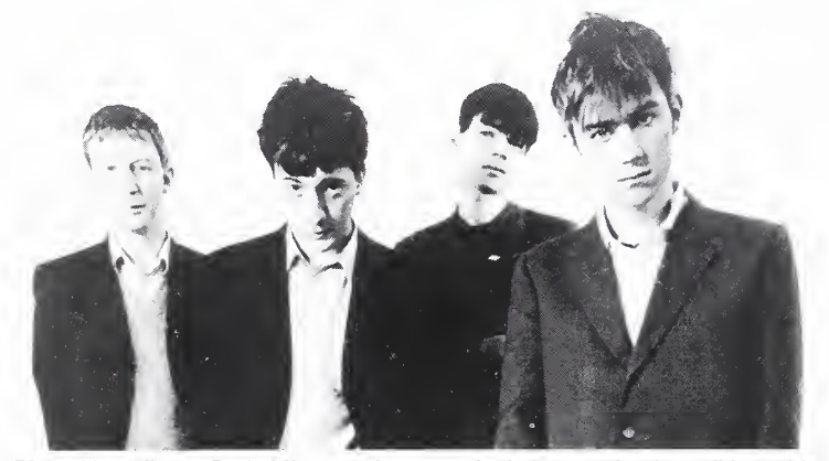
Blur—The album Park Life may have peaked, but a clearly striking video accompanies their single "Girls & Boys."

BACK CATALOGUE CHART : The talk of introducing a "Back Catalogue Chart" here in the U.K. is intensifying. Last week Woolworth 's announced a CD promotion offering 60 titles for £8.99. The chain's campaign also offers cassettes at £5.99. The result of this was 26 re-entries into the Top 75. This week Our Price Records launched its summer sale campaign into its 310 stores, offering 50 front-line titles, which include current hits by Take That , M People and Pearl Jam . The industry is now discussing the possibility of adopting a chart similar to that used in the U.S. in order to prevent retail promotions dominating the album chart.