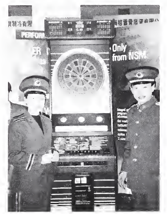
Chinese Arm y members at Valley "Cougar."

AAMA previously arranged for extensive booth space at this show, which is directed to the Chinese hotel, restaurant and catering industry, through the U.S. Consulate in Shanghai. The American-contingency booth was located in the Leisure & Entertainment section of the exhibit hall.