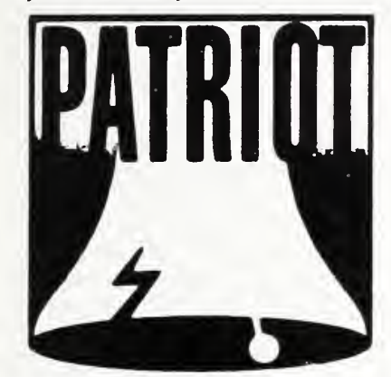
Nashville's Patriot Records logo.

les, their label had already owned the registered name and had been incorporated since August of 1992.