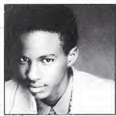
#1 SINGLE: Tevin Campbell

(Warner Bros. N/A) EI Debarge DEBUT 49 STAY (EMI/ERG 58065) Eternal 34 12