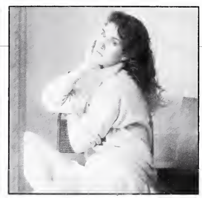
TO WATCH: Celine Dion