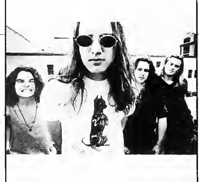
TO WATCH: Candlebox