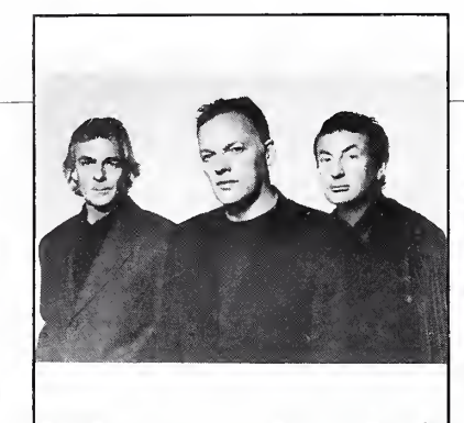
#1 ALBUM: Pink Floyd