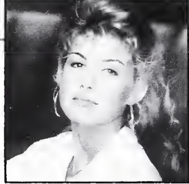
#1 SINGLE: Faith Hill