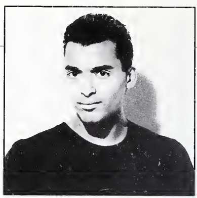
HIGH DEBUT: Jon Secada