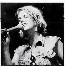
HIGH DEBUT: Mary-Chapin Carpenter #36