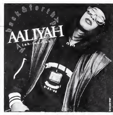
TO WATCH: Aaliyah

(Warner Bros. N/A) EI Debarge DEBUT 49 STAY (EMI/ERG 58065) Eternal 34 12