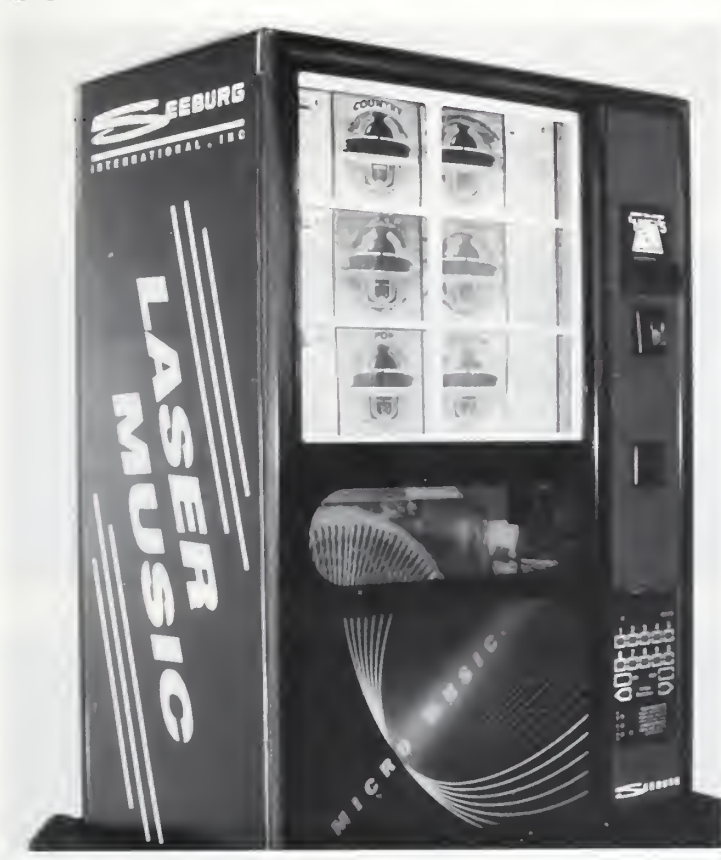
Seeburg's Micro Music.

CHICAGO —ACME '94 provided the setting for the introduction by Seeburg International of its unique, new Micro Music wall-mounted jukebox.