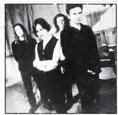
HIGH DEBUT: Cranberries