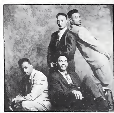
HIGH DEBUT: Portrait