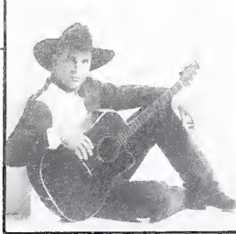
#1 SINGLE: Garth Brooks