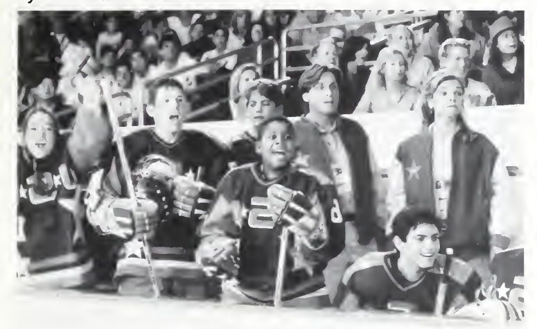
Disney's Ducks cheering their teammates on. Quack! Quack!

THE FILM THAT INSPIRED a Mighty Ducks National Hockey League team has inspired a sequel. Surprising?...Nahhhhh. Hey, look, The Mighty Duck$ was tremendou$ly popular. Plenty of reason$ for Walt Disney Pictures to re-do it. But D2 The Mighty Ducks is not a re-do; it stands on its own as a complete entity, expanded and fleshed out, with something more to say, and look for it to do $trong box-office just like its predecessor.