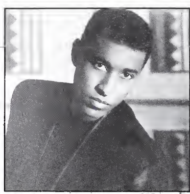
TO WATCH: Babyface