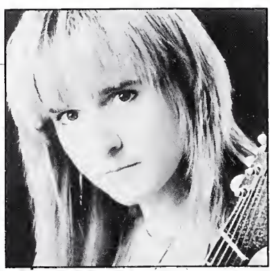
TO WATCH: Melissa Etheridge