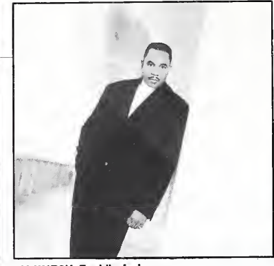
TO WATCH: Freddie Jackson