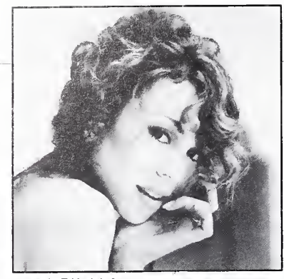
#1 SINGLE:Mariah Carey