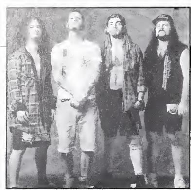
#1 ALBUM: Pantera

FAR BEYOND DRIVEN (EastWest 92302) . . . . . . . . . PANTERA DEBUT LONGING IN THEIR HEARTS (Capital 81427) ..... BONNIE RAITT DEBUT 3 SUPERUNKNOWN (A&M 314540198) ..... SOUNDGARDEN 1 3