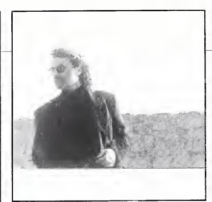
TO WATCH: Enigma