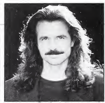
TO WATCH: Yanni