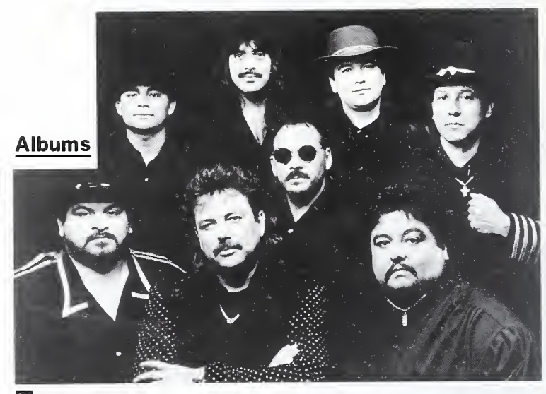
MAZZ: Qué Esperabas (EMI Latin H4 72438)

25 A DONDE VOY (Elektra) . . . . . . LINDA RONDSTADT 18 5