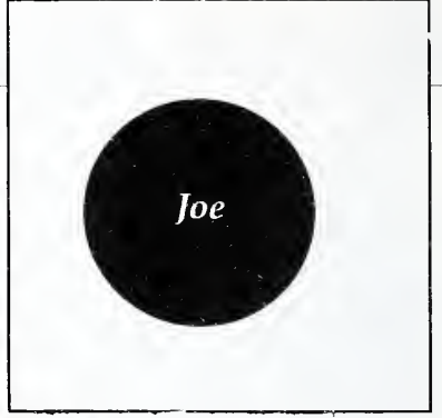
HIGH DEBUT: Joe