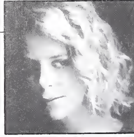
#1 SINGLE: Mary-Chapin Carpenter