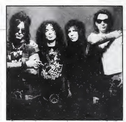
HIGH DEBUT: Motley Crue