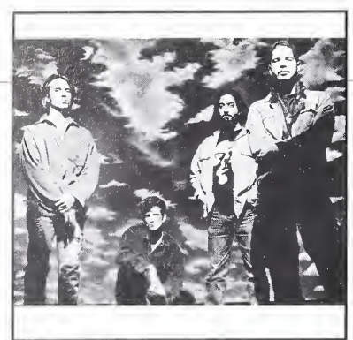
#1 ALBUM: Soundgarden