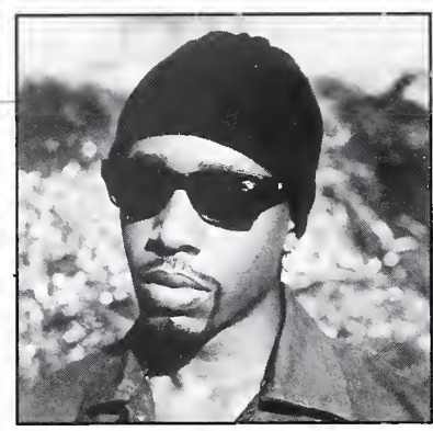
TO WATCH: Hammer