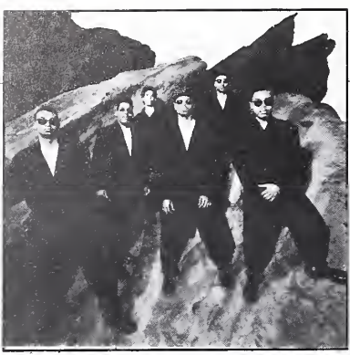
#1 SINGLE: Mint Condition