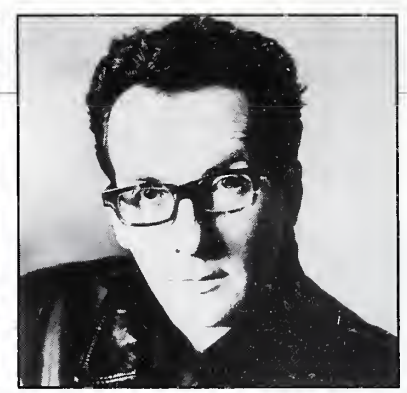
HIGH DEBUT: Elvis Costello