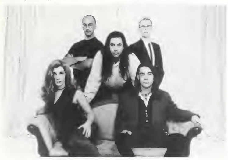
Crash Test Dummies

PALACE, HOLLYWOOD, CA—The surprise success story of early 1994 has to be Canada's Crash Test Dummies. The band's second album, God Shuffled His Feet (Arista), has unexpectedly crashed the top 30, propelled by the radio popularity of similarly charted first single "Mmm Mmm Mmm Mmm," an unlikely yet quite hummable pop tune. And no on seems more surprised than the band itself.