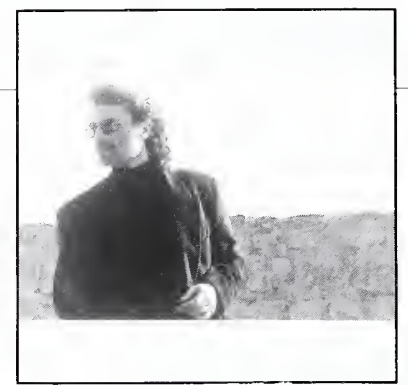
TO WATCH: Enigma

RETURN TO INNOCENCE (Virgin 14122) ..... Enigma DEBUT