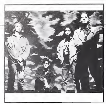
#1 ALBUM: Soundgarden