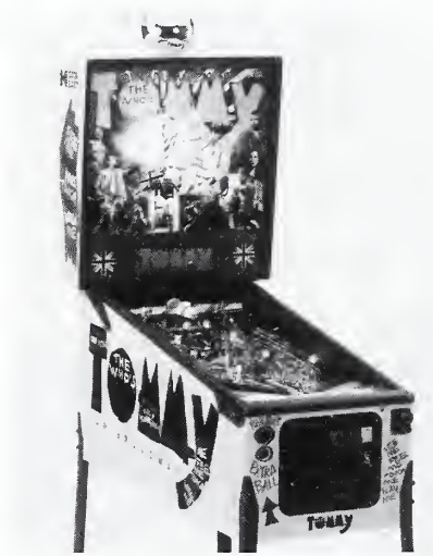
Data East's The Who's Tommy Pinball

CHICAGO-Once again the expertise of Data East and the excitement of Broadway have come together to present Data East's latest pingame The Who's Tommy Pinball Wizard.