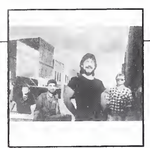
#1 SINGLE: Alabama