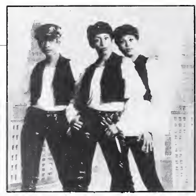
TO WATCH: Black Girl