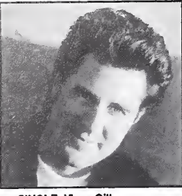
#1 SINGLE: Vince Gill