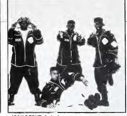
HIGH DEBUT: Jodeci