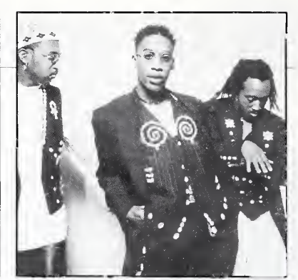
HIGH DEBUT: Tony, Toni, Tone