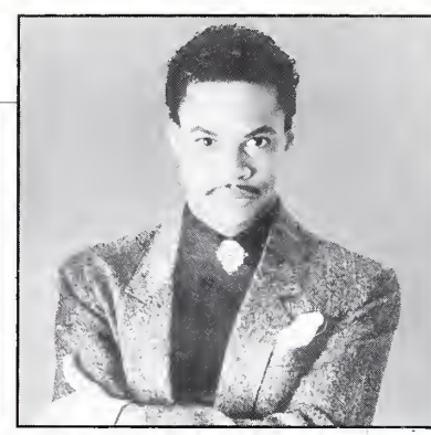
TO WATCH: Zapp & Roger