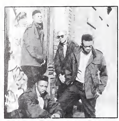
#1 SINGLE: Jodeci