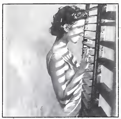
TO WATCH: Celine Dion

54 REAL MUTHAPHUCKKIN G'S (Ruthless/Relativity 5508) ..... Eazy E 51 5