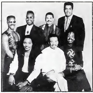
TO WATCH: Earth, Wind & Fire