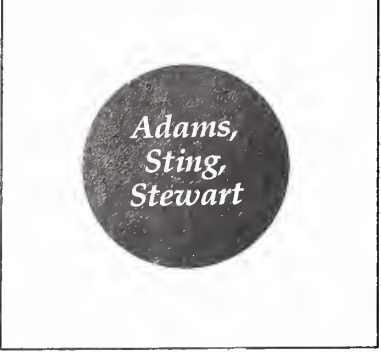
#1 SINGLE: Adams, Stewart, Sting

54 REAL MUTHAPHUCKKIN G'S (Ruthless/Relativity 5508) ..... Eazy E 51 5