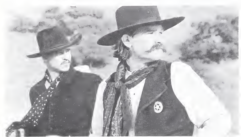
Val Kilmer and Kurt Russell are Doc Holliday and Wyatt Earp in a fine recreation of the Old West's Tombstone .

IF THE QUALITY OF WESTERNS remains as high as 1992's Unforgiven and 1993's Tombstone we're in for some treats. A few moments of continuity distraction keep this George P. Cosmatos film, Buena Vista Pictures release from being totally engrossing, but that's all.