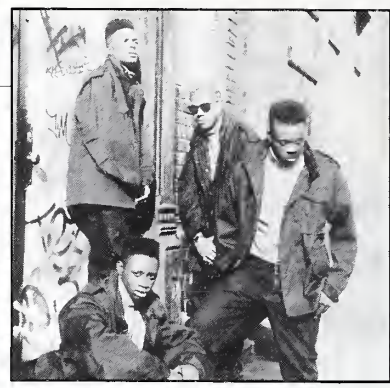
HIGH DEBUT: Jodeci