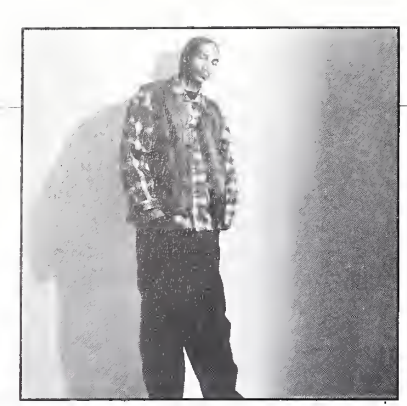
#1 ALBUM: Snoop Doggy Dog