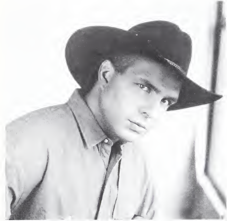
Garth Brooks: Rarin' to take England by storm

ALTHOUGH 1993 IS NOW (JUST) HISTORY it is too early to be preceise as to who the best sellers and most successful artists and labels were. The Christmas figures will not be available for another couple months and the Christmas-time of the year accounts for up to one-third of annual sales.