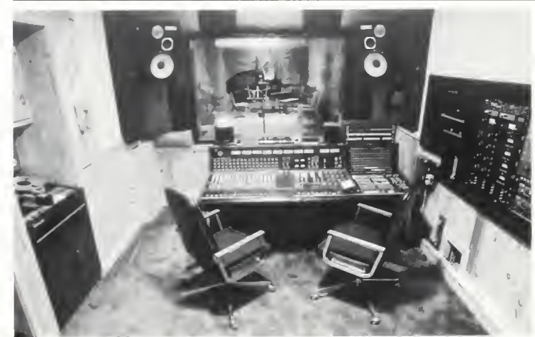
Win this multi-track recording studio for $100 & a winning song!

INDIE NEWS BRIEF—Studio For A Song Contest: Enter the Studio For A Song contest for the opportunity of winning your very own recording studio. Each original song submitted must be on its individual audio cassette accompanied by a completed entry form and lyric sheet, two legal size self-addressed stamped envelopes and include either certified check, cashiers check or money order for the $100.00 U.S. funds entry fee made payable to "Studio For A Song Contest" P.O. Box 958 Lewiston, Maine 04243-0958 U.S.A. For more detailed information and contest rules call (207) 786-3476. Good Luck!