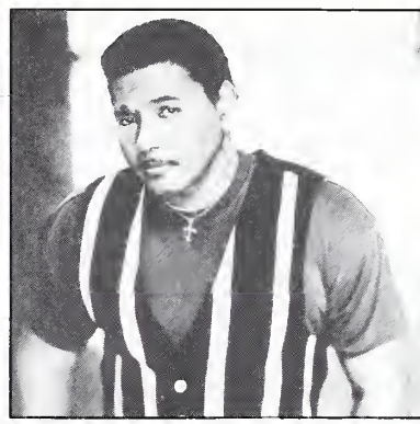
TO WATCH: Aaron Neville