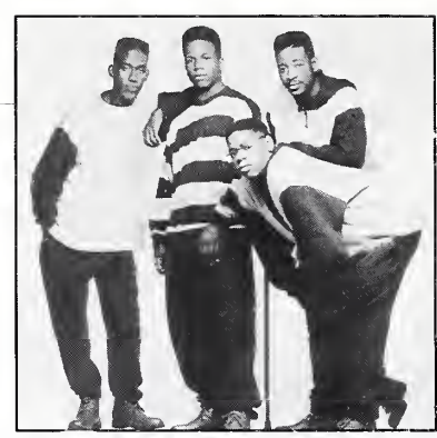
TO WATCH: Boyz II Men