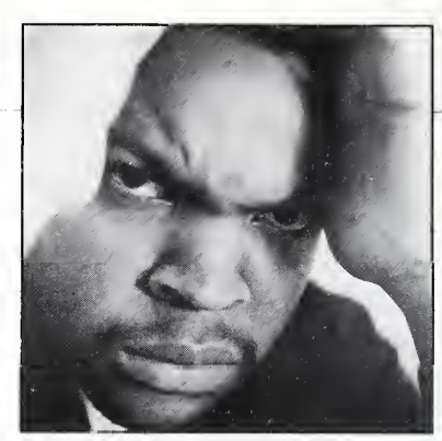
HIGH DEBUT: Ice Cube