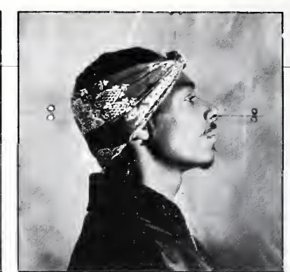
HIGH DEBUT: Snoop Doggy Dog