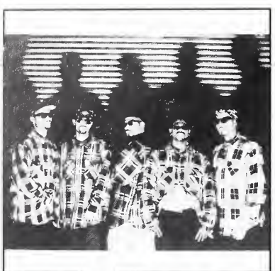
#1 SINGLE: DRS