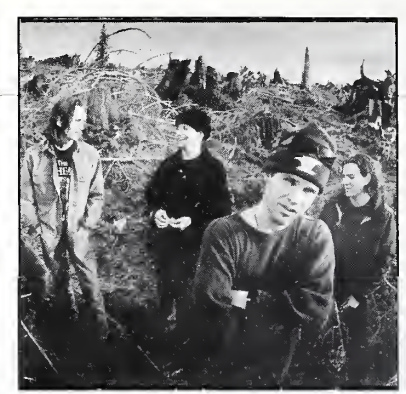
HIGH DEBUT: Pearl Jam