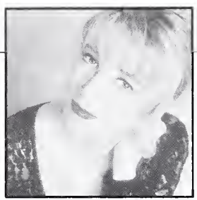
#1 SINGLE: Tanya Tucker