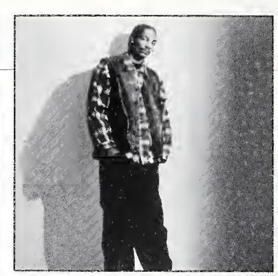
HIGH DEBUT: Snoop Doggy Dog #3