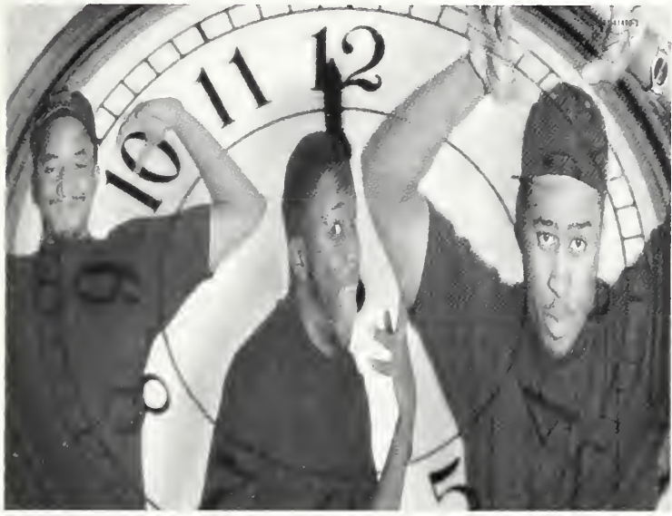
A Tribe Called Quest

PALACE, HOLLYWOOD, CA-It was a case of East meets West as New York-based hip-hop innovators De La Soul and A Tribe Called Quest brought their inventive, decidedly East Coast-flavored stylings to Hollywood's sold-out Palace, supported by young Bay-area crew