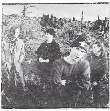
#1 ALBUM: PEARL JAM