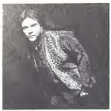
#1 SINGLE: MEATLOAF