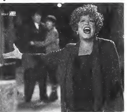
Everything's coming up Midler