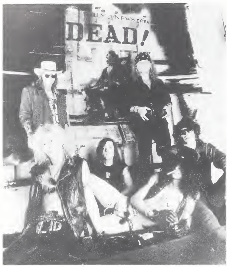
Guns N' Roses: Future Meat-beaters?

RIGHTS SOCIETIES MERGE... Britain's two main rights societies, the performing and mechanical rights representatives, have taken steps towards a much closer union following the announcement that they are to administer royalties jointly.