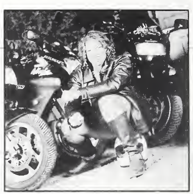
HIGH DEBUT: Queen Latifah