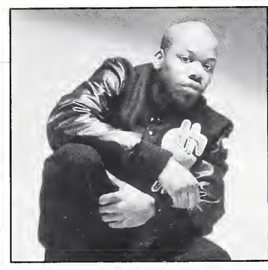
TO WATCH: Too Short