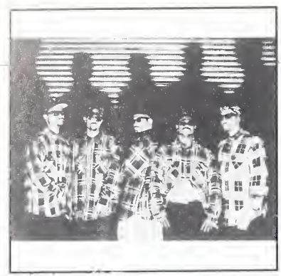
#1 SINGLE: DRS