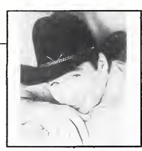
TO WATCH: Clint Black #21

QUEEN OF MY DOUBLE WIDE TRAILER (Mercury 969)