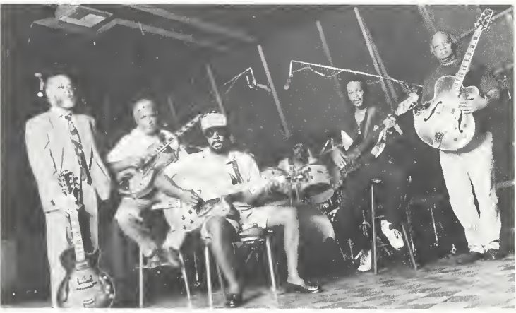
Spirit Traveler All-Stars

A QUARTET OF TOP FLIGHT GUITARISTS has been assembled for a stellar tribute to some of Motown Records' best talent and hit singles. Dubbed Playing The Hits From The Motor City , by Spirit Traveler, the project has been released by JVC Music. The company has developed an urban radio and retail-intensive campaign for the project that includes special merchandising and pricing. In addition to tracks like "Signed, Sealed Delivered I'm Yours," "Ain't That Peculiar," "Tracks of My Tears" and eight other Motown classics, the all-star band has recorded a holiday bonus track, "Merry Christmas, Baby."