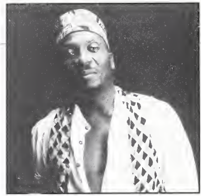
TO WATCH: Jimmy Cliff