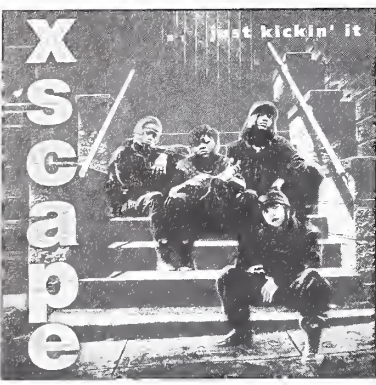
#1 SINGLE: Xscape