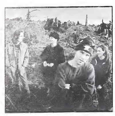
#1 ALBUM: PEARL JAM