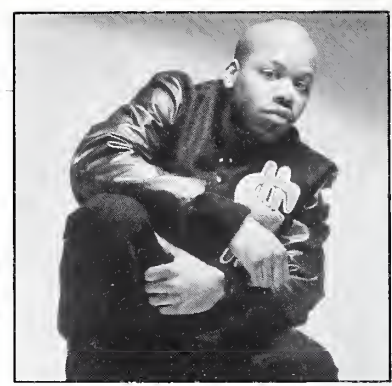
HIGH DEBUT: TOO SHORT