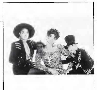
TO WATCH: SALT -N-PEPA