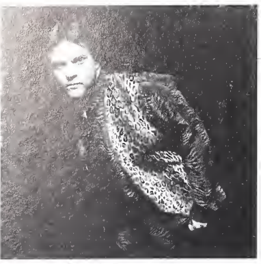
#1 SINGLE: MEATLOAF