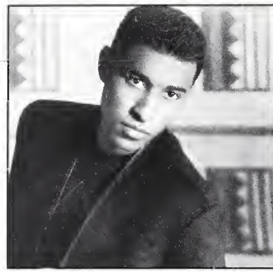
TO WATCH: BABYFACE