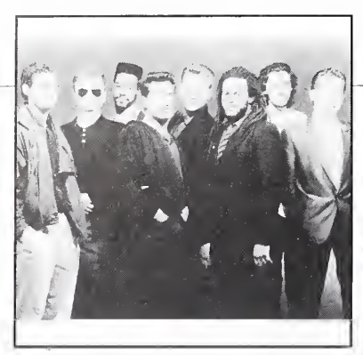
#1 SINGLE: UB40