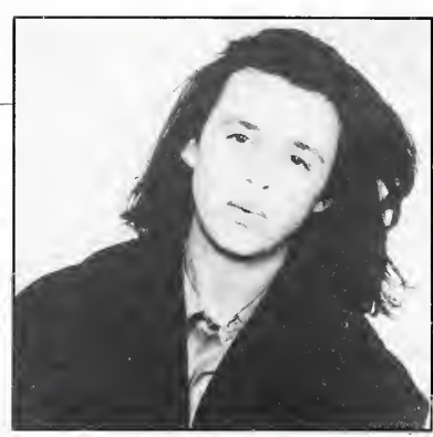
TO WATCH: Tears For Fears