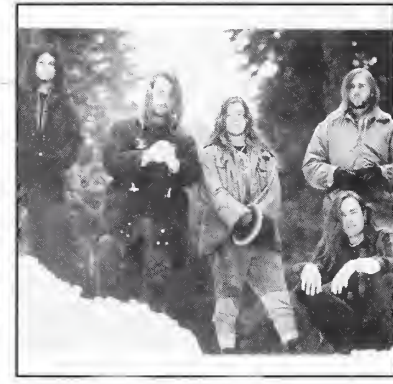
TO WATCH: Blind Melon

50 DIRT (Columbia 52475)(P) . . . . . . . . . . . . . . . . . ALICE IN CHAINS 56 38