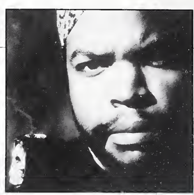
HIGH DEBUT: Ice Cube