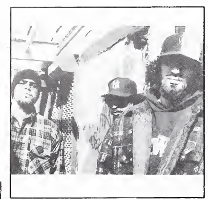
#1 ALBUM: Cypress Hill

50 DIRT (Columbia 52475)(P) . . . . . . . . . . . . . . . . . ALICE IN CHAINS 56 38