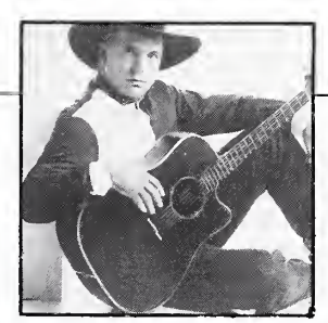
HIGH DEBUT: Garth Brooks #28