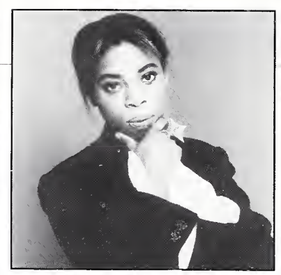
TO WATCH: Tasmin Archer