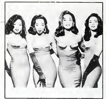
HIGH DEBUT: En Vogue