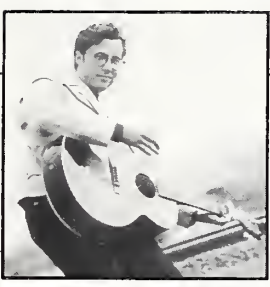
#1 SINGLE: Radney Foster