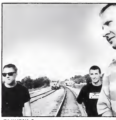
TO WATCH: Sugar