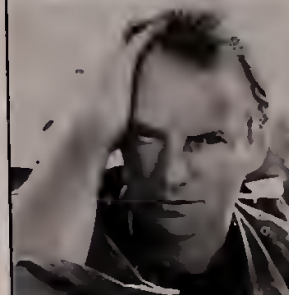
HIGH DEBUT: Sting #1