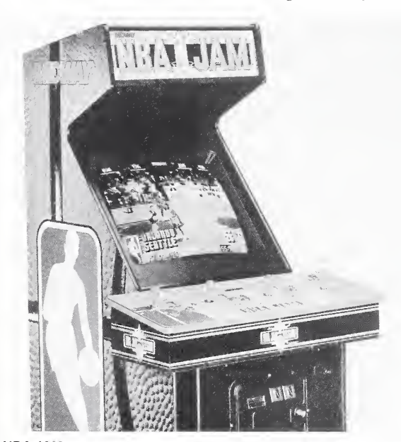
Midway's NBA JAM

Further information may be obtained through Midway distributors.