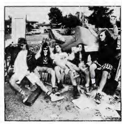
TO WATCH: Ugly Kid Joe