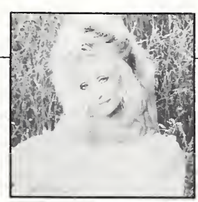
TO WATCH: Dolly Parton #22