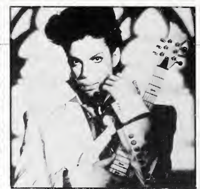
HIGH DEBUT: Prince