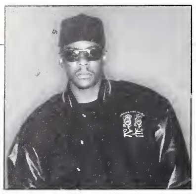
#1 SINGLE: Bobby Brown