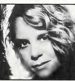
#1 SINGLE: Mary-Chapin Carpenter