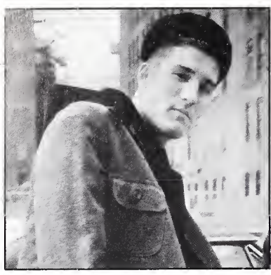
#1 SINGLE: Snow