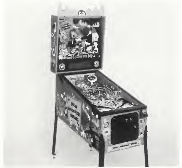
Data East's The Adventures Of Rocky & Bullwinkle & Friends

Further information may be obtained through factory distributors or by contacting Data East USA, Inc. at (408) 286-7080.