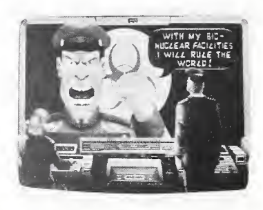
Screen Shot of Midway's Total