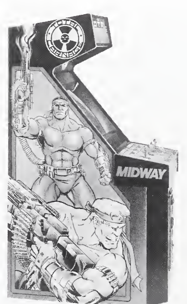
Midway's Total Carnage

Total Carnage delivers a solid storyline and high energy excitement to fully satisfy the demands of today's players! Further information may be obtained through factory distributors or by contacting Midway at 3401 N. California Ave., Chicago, IL 60618.