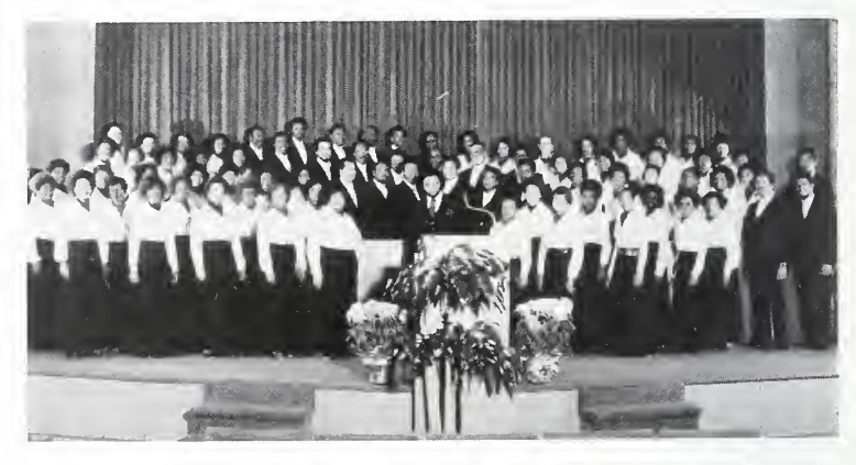
The Temple Ensemble