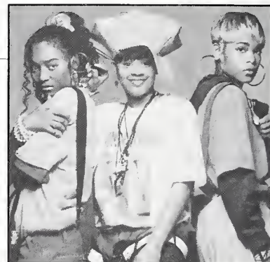
TO WATCH: TLC #27