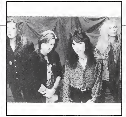
HIGH DEBUT: Mr. Big #69