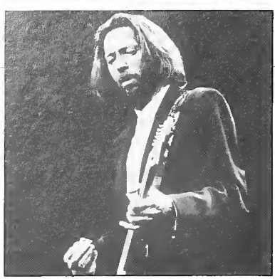
#1 SINGLE: Eric Clapton