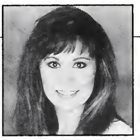
#1 INDIE: Fats Domino/