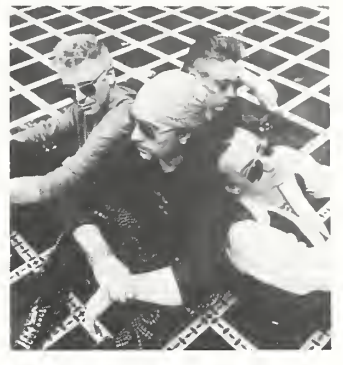
$1,000 for a ticket?

YEAH, I WENT: No, 1 didn't pay (critical immunity). Sure, it was the hottest ticket in town. True, U2 hasn't toured in five years, and they have a great new album out. Plus, I hadn't seen them live. But Bono himself, after learning how much the tickets were being scalped for, said in disbelief "You must either be crazy, or... very rich."