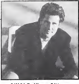
#1 SINGLE: Vince Gill