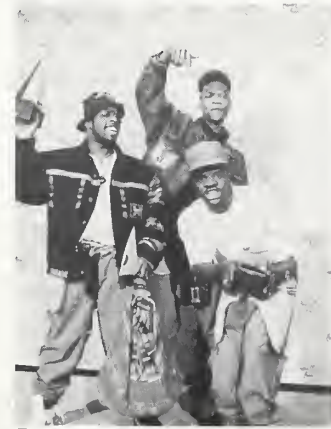
Bell Biv Devoe