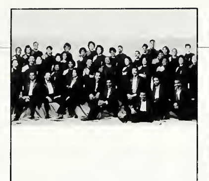
#1 SINGLE: The Sounds of Blackness