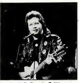
#1 SINGLE: Travis Tritt