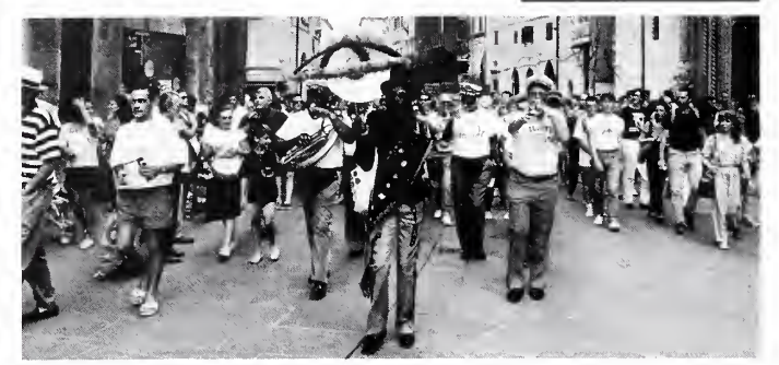
STRUTTIN' WITH SOME BRUSCHETTA

UMBRIA: There's something disconcerting about watching the Olympia Brass Band marching down Perugia's ancient Corso Vanucci with the citizens of that ancient Italian hilltown trailing behind them.