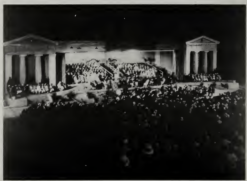
Greek Theatre circa 1932

In an offical statement, Frank Sinatra—who isn't touring, but will make a special appearance at the Greek on August 1 in celebration of the 60th anniversary—noted, "In 1931, when the Greek Theatre opened, the Star-Spangled Banner' was officially designated as the country's national anthem. So you see, the theatre is in good company. Congratulations on 60 years of great music, and I plan to be on your stage for each of the next 60!"