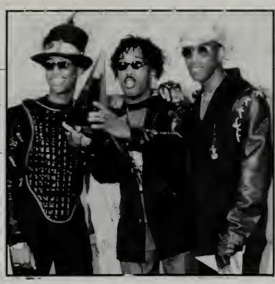
#1 Single: Tony! Toni! Tone!