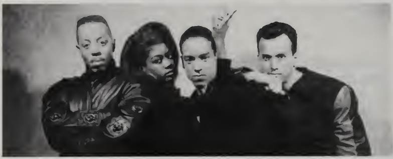
C&C Music Factory

C&C Music Factory has been signed by Coca Cola for a national promotional