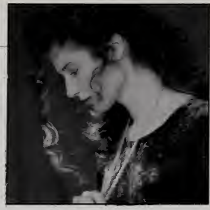
#1 Single: Amy Grant