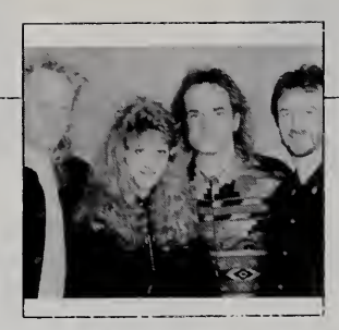
High Debut: Highway 101 #44 To Watch: The Judds #32