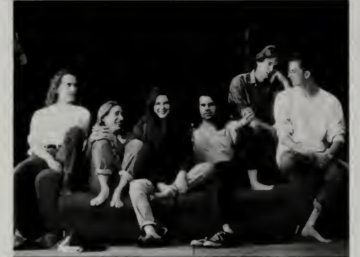
Edie Brickell & New Bohemians