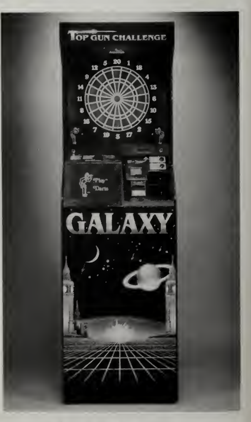
English Mark Darts Galaxy

Further information regarding the numerous advantages and time-saving aspects of the Galaxy concept may be obtained by contacting Arachnid, Inc. at 6421 Material Ave., P.O. Box 2901, Rockford, IL 61132-2901.