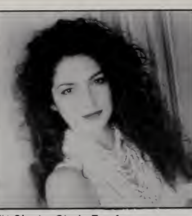
#1 Single: Gloria Estefan