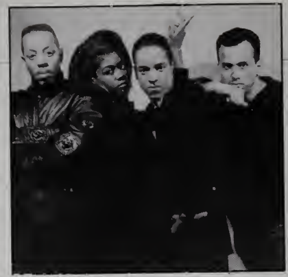
To Watch: C+C Music Factory #42