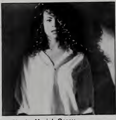
#1 Single: Mariah Carey