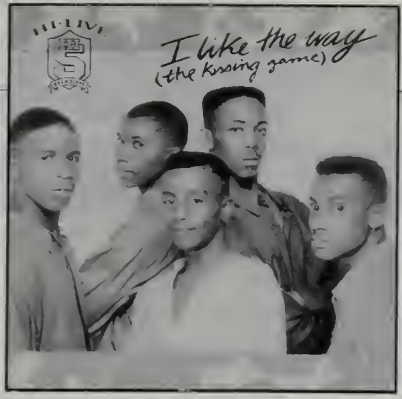
#1 Single: Hi-Five