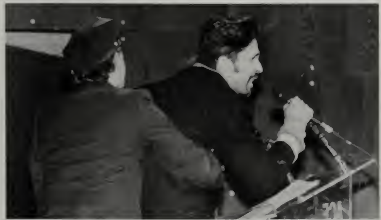
THEN THERE'S THE A.C.E., SETTING ANOTHER POSITIVE standard once again during its March 2 Avery Fisher Hall event, with the unexpected interruption by ACT-UP activists protesting alleged municipal misuse of AIDS-related funds. Contrary to the

Until then, Papo Público, like record executives, will only think of the Latin Grammys as over-glorified dust collectors.