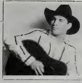
#1 Single: Garth Brooks