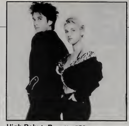
High Debut: Roxette #52