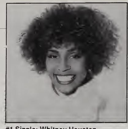
#1 Single: Whitney Houston