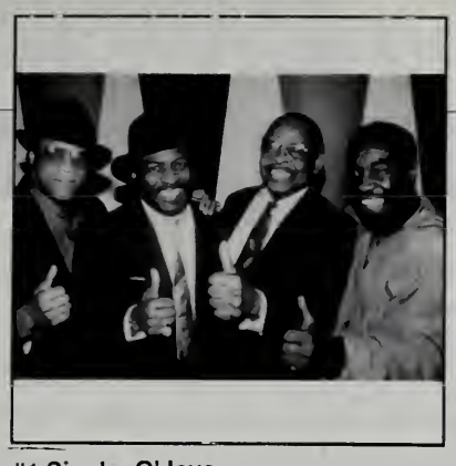
#1 Single: O'Jays