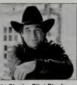
#1 Single: Clint Black