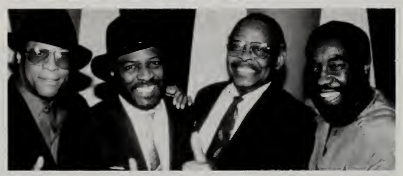
THEY STILL LOVE MUSIC: The O'Jays were recently in New York to celebrate the release of their new EMI album, Emotionally Yours , when they were greeted by surprise guest, Eddie O'Jay, the Cleveland disc jockey from whom they took their name in 1962.