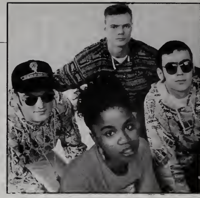
To Watch: Bingo Boys #59