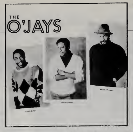
High Debut: The O'Jays #66