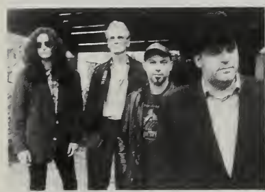
Masters of Reality