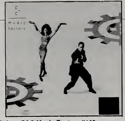
High Debut: C&C Music Factory #148

(G) = GOLD (RIAA) Certified) (P) = PLATINUM (RIAA) Certified)