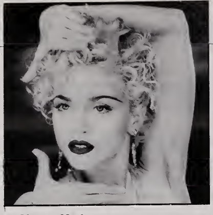
#1 Single: Madonna