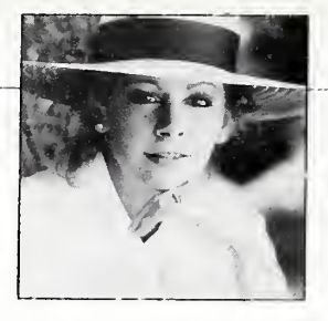
To Watch: Reba McEntrle #28