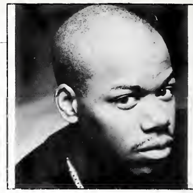
To Watch: Too Short #46