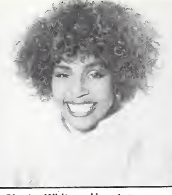
#1 Single: Whitney Houston