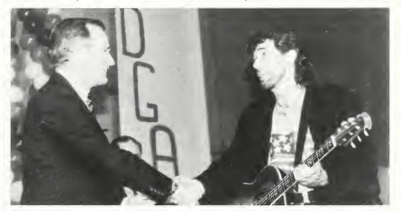
President George Bush and singer/songwriter Eddie Rabbitt reach out to each other following Rabbitt's performance of his hit single, "American Boy" at the College of Dupage outside Chicago, Illinols. The President had requested Rabbitt perform what he declared to be the new anthem for our military stationed in Saudi Arabia. Also shown is a copy of the letter which President Bush sent to Rabbitt in acknowledging the "American Boy" release.