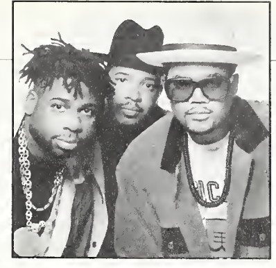
High Debut: Run-D.M.C# 65