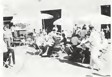
What's a celebration without food and drink!—there was plenty on hand for everyone to enjoy—and enjoy they did out on the backlot of the C.A. Robinson & Co. facilities!