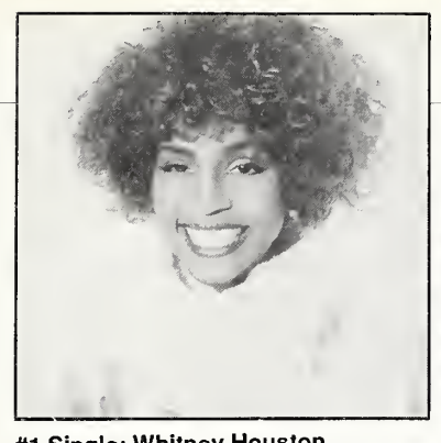
#1 Single: Whitney Houston