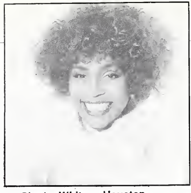
#1 Single: Whitney Houston