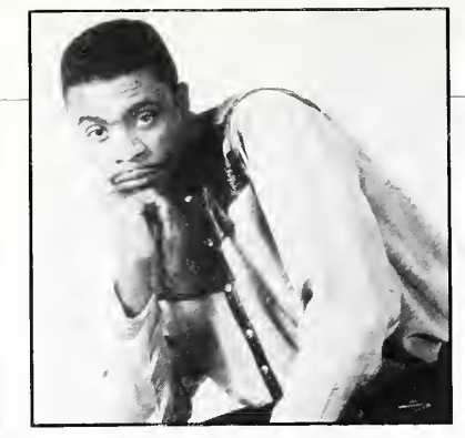
High Debut: Keith Sweat #52