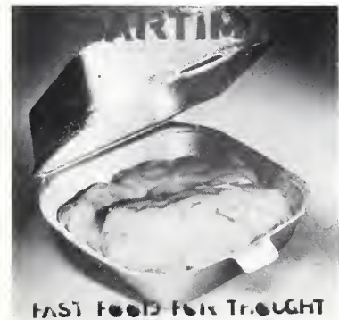
□ WARTIME: Fast Food For Thought (Chrysalis F2 21753)

hought (Chrysalis F2 21753) Wartime, a crew lead by Henry Rol-