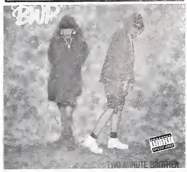
□ BWP: "Two Minute Brother" b/w "We Want Money" (No Face/Columbia 44 73574)

BWP, a female hardcore rap crew whose name stands for Bitches With Problems, cold gets raw on the explicit "Two Minute Brother" and the avaricious "We Want Money," which samples The O'Jays' "For The Love Of Money" but praises greed instead of denouncing its evils. Not for the squemish.