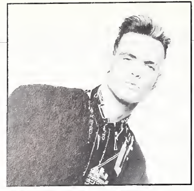
#1 Single: Vanilla Ice