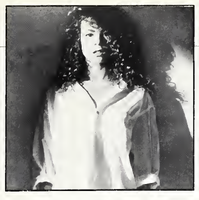
#1 Single: Mariah Carey