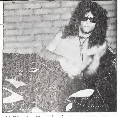
#1 Single: Bon Jovi