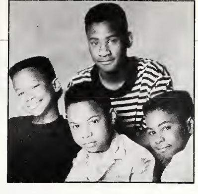
#1 Single: The Boys