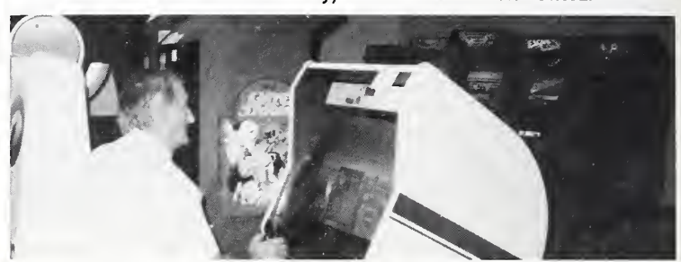
This op from Dino's Amusement was too wrapped up in playing Taito's Air Inferno to stop for a formal pose, but he gave us his quick "okay" on the new game and went right on playing.