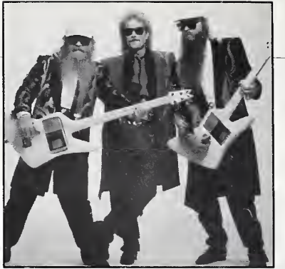
To Watch: ZZ Top #45