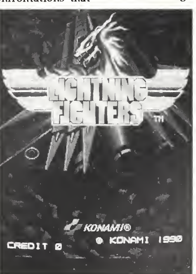
s, Screen Shot of Konami's 'Lightning ad Fighters'

Further information may be obtained through factory distributors or by c on t a c t i n g Konami, Inc. at 900 Deerfield Parkway, Buffalo Grove, IL 60089-4510.