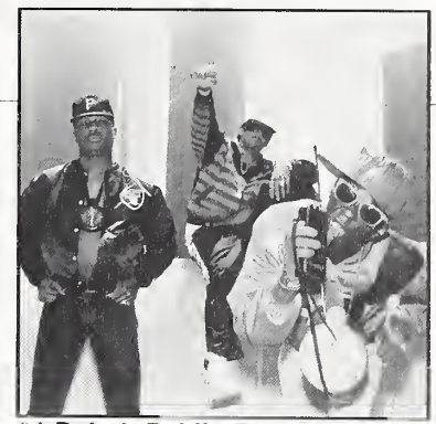
#1 Debut: Public Enemy #75