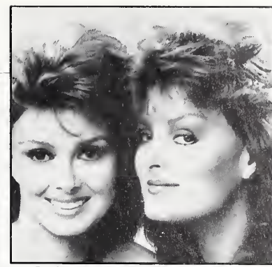
#1 Debut: The Judds #62