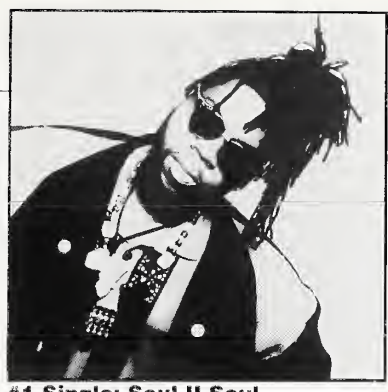
#1 Single: Soul II Soul