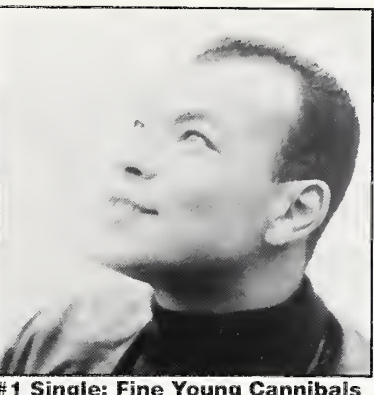
#1 Single: Fine Young Cannibals