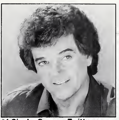
#1 Single: Conway Twitty