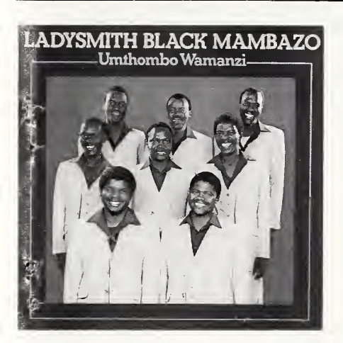
LADYSMITH BLACK MAMBAZO Umthombo Wamanzi - Shanachie (43055) - Producer: West Nkosi

here's something that's genuinely touching about Ladysmith Black Mambazo, the South African gospel