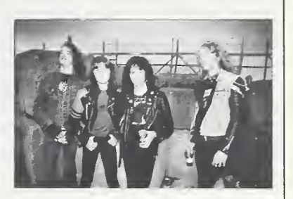
METAL'S FINEST—Elektra's Metallica bring their uncompromising brand of bonecrunching metal to the Felt Forum August 20.

Do For Me," sounding as fresh and flexible as Prince circa "Lady Cab Driver." By set's end people were still requesting songs. She asked the audience whether they wanted "Love Of A Lifetime" or "Ain't Nobody" and the crowd chose the latter. Chaka played it to its anthemic hilt, offsetting the funk with rock abrasiveness. Two encores later, people were still up and dancing to a quiet storm that had turned into a veritable electrical thunderstorm.