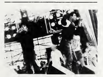
Walk This Way—Run DMC— (Profile)