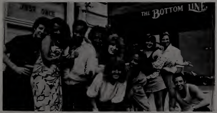
The cast of Just Once

The producers obviously hope that the Bottom Line audiences get "Kicks" and "Soul and Inspiration" at Just Once; that "Somewhere Down the Road" the show ends up "Uptown" "On Broadway" with a cast album, following in Leader of the Pack's "Footsteps," but that's just "The Shape of Things to Come."