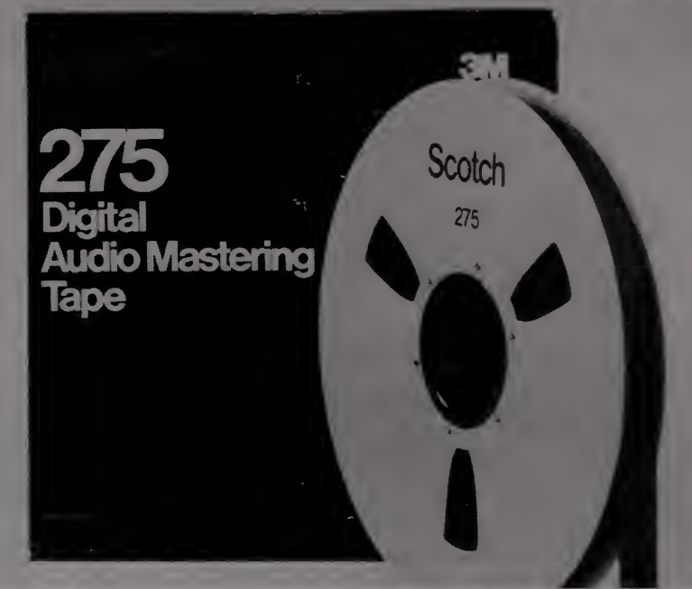
DIGITAL EXCITEMENT — Suitable for recording and playback on digital hardware, 3M's new Scotch 275 Digital Audio Mastering Tape is available in many different widths and lengths. The tape features a highly durable binder system for increased durability.