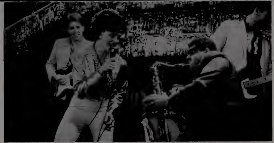
SWEET MUSIC — Jessica Lange strikes up the band in a scene from Sweet Dreams, in which the actress portrays legendary country singer Patsy Cline.