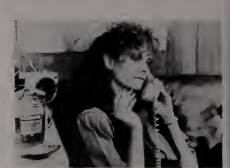
LONELY LADY - Lesley Ann Warren is pictured in a scene from the Alan Rudolph film Choose Me, new from Media Home

images. The video can't decide whether it is a documentary-like view of one of the most popular acts of the '60s, captured forever during its blossom years, or a collage of visuals from no particular space in time that just happen to compliment the music. Because there is more original Doors footage here than not, the balance seems to be in favor of more true to period views. Attempts at period were made. A '67 Mustang was recruited for the opening of "L.A. Woman," for instance, Automated banking, however, did not exist when the original Doors clips were shot, and the sudden appearance of Security Pacific's "Ready Teller" during a street scene