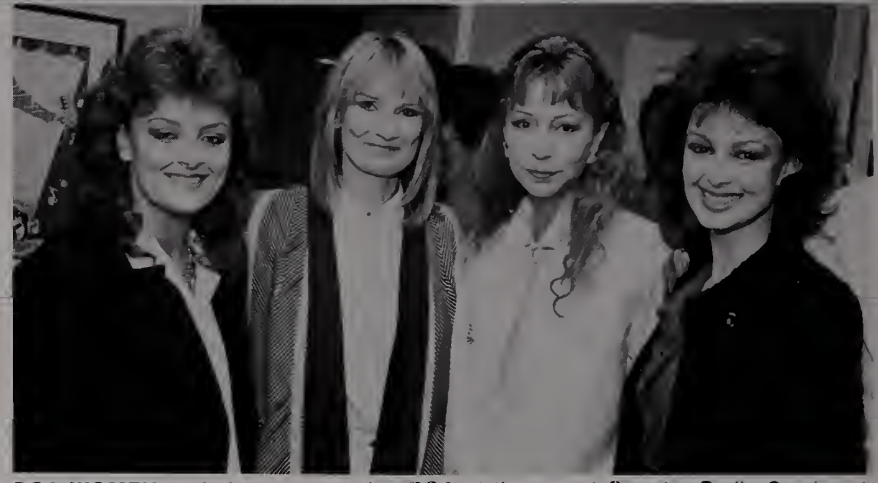
RCA WOMEN - Artists representing RCA at the recent Country Radio Seminar in Nashville included the four women above. (I-r), Wynonna Judd, Gail Davies, Juice