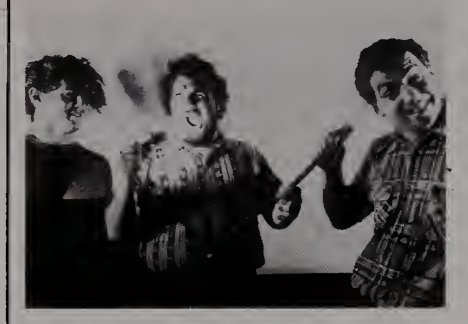
HAVE YOU GOT A MINUTE-MEN? -- The Minutemen will be one of five SST groups making the rounds next weekend on the west coast.

THE CIRCUS COMES TO TOWN — More bad than The Jacksons, more spectacular than The Boss, it's, it's . . . The Tour. Many had thought that they had already seen Prince in concert — after all, what is Purple Rain really, but a concert film? And from early reports of The Tour, it seemed that Minneapolis' reigning royalty did stick rather close to the album/film's repertoire. Yet, somewhere along the way, word got through to pay a little homage to past glories — whether they were glories in the commercial sense or not. Lo and behold, the Prince show which came to the Los Angeles Forum last week for six dates (and the Long Beach Auditorium for three) had a healthy dose of just about everything you could want. Pure hard rock 'n' soul — "Delirious," "1999," "Little Red Corvette" — an indulgent but revealing solo piano foray which