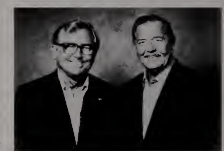
celebrate their 25th year with ABC's WMAL in Washington, D.C. An all star gala is scheduled to be broadcast live from the Kennedy Center's grand foyer on March 7.