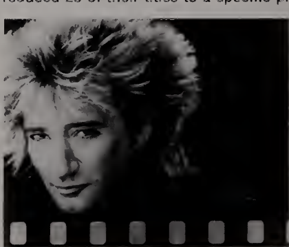
ROD VID — Warner Bros. recording artist Rod Stewart was taped in concert at the San Diego Sports Arena Nov. 4-5 for a 60-minute CINEMAX special due later this month.

NEW RELEASES — Six titles have been released by VidAmerica as of October 3. The titles are available for $59.95 each and they include Seance On A Wet Atternoon, a British suspense thriller, The Man In Gray; and Black Narcissus. Also already in release (rerelease) are three football cassettes: NFL SymFunny/Super Bowl III (Jets/Colts), Football Follies/Super Bowl V (Cowboys/Colts); and Son Of Football Follies/Super Bowl XIV (Steelers/Rams). Each retails for $34.95. A special Christmas gift package of Gunga Din, Citizen Kane and the Original King Kong, packaged in their own gold case and retailing for $99 is another VidAmerica fall release . . Thern EMI is soon to release a 14-volume videocassette series of Upstairs Downstairs episodes, entitled The Best of Upstairs/Downstairs. The set retails for $29.95 . . . Paramount Horne Video reports that preorders for its "25/25" promotion have exceeded 10 million. The deal is that Paramount has reduced 25 of their titles to a specific price of $24.95, in case you haven't heard. The cut off date for preorders was