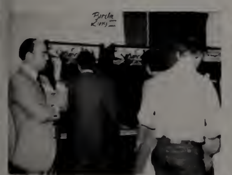
Another of this year's show hits was "Birdie King III" which, as you can see, drew heavy visitor traffic.