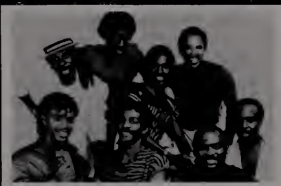
KOOL AND THE GANG (Delite-Poly-