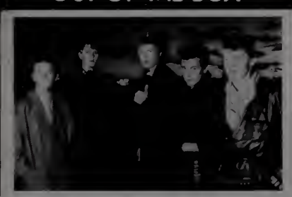
Duran Duran — Capitol SWAV 12374 — Producer: Duran Duran — List: 8.98 — Bar Coded

This live album with performances from "around the world" is something of a greatest hits package with one new studio track "The Wild Boys" included. The band sounds tight if predictable on the tracks "Is There Something I Should Know?," "Hungry Like A Wolf," 'Union Of The Snake" and others, and "Arena" should become Duran Duran's biggest seller with a broad-based audience from pre-teens to AOR radio. Excellent timing and packaging which includes a four-color booklet of the