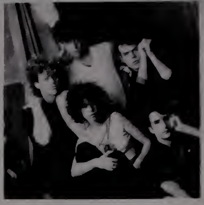
Face To Face