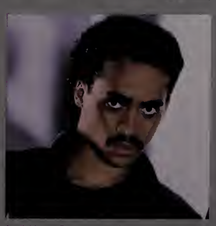
Available on Records and High Quality XDR® Cassettes from Capitol.