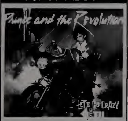
PRINCE and the REVOLUTION (Warner Bros. 7-29216)

Let's Go Crazy (3:46) (Prince) (Producer: Prince)