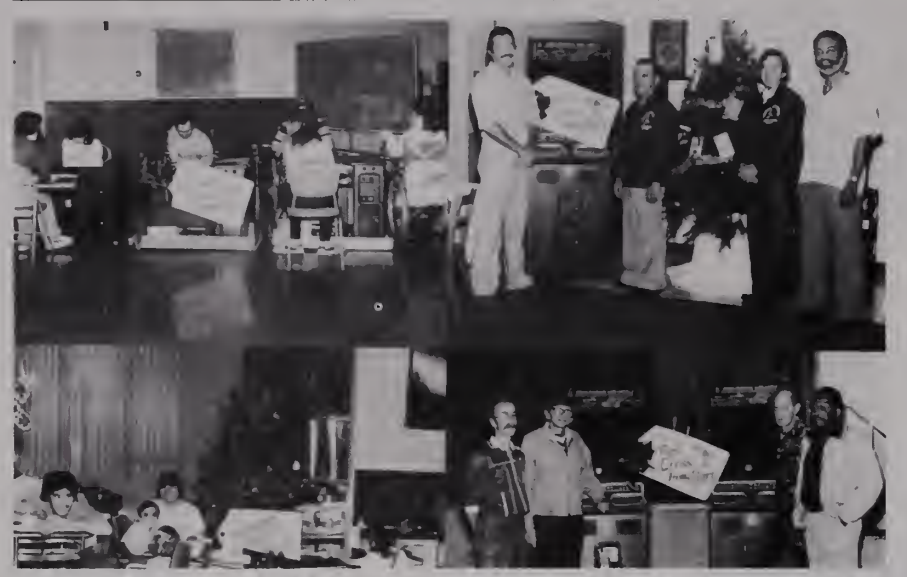
HOLIDAY SPIRIT — The Veterans Administration Hospitals and a variety of children's hospitals were among the many organizations to receive a special Christmas gift from Atari coin-video games. The company donated over 400 "free-play" games to San Francisco Bay Area and Baltimore, Md. charities. San Francisco Bay Area charities included the Menlo Park (upper right) and Palo Alto (lower right) chapters of the Veterans Administration hospitals; The Chandler Tripp School for orthopedically handicapped children in San Jose (upper left) and the Shriners Hospital for Crippled Children in San Francisco (lower