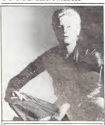
THIS IS ANOTHER TEASER AD

NEW YORK - The Capehart Corporation, manufacturer and distributor of home entertainment systems, announced unaudited results for the six months ending September 30, 1975, showing an increase in sales to $22,906,000 from $19,972,000 in the year ago períod. Capehart showed a six month net loss of $855,000 after deducting an extraordinary credit of $3,800,000 for an overall loss of $4,155,000