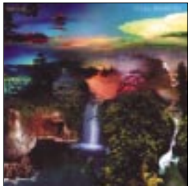
TORTOISE It's All Around You Thrill Jockey