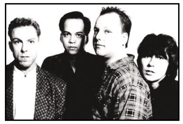
Pixies to CMJ: "Can you hear me now?"

Independent retail has accounted for over 50% of Pixies sales since Come On Pilgrim. On this tour, after each show leading up to and including Coachella fans will be able to pick up a burned copy of the show they've just witnessed from onsight production company DiscLive (which is traveling with the band). Discs cost $25 after the show (or can be pre-purchased online) and only 1000 copies of each show will be made. This is a very cool thing for fans (who want to hear the show with better quality than a cell phone can provide). But this is a big disappointment for accounts who have fully embraced the band these many years and who for the time being will not have access to these limited editions. A special live piece that takes the best performances from the '04 tour should be considered—at a minimum.