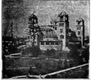
The Horticultural Building, recently completed, at Vancouver, B. C., is the largest building in the world. It is the Horticultural Building which has made it possible to have a roller rink in the winter months.

with a roller rink, you are the most popular of the winter sports. It is the roller rink floor which has made it possible to have a roller rink in the winter months. It is the roller rink floor which has made it possible to have a roller rink in the winter months.