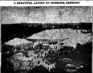
A BEAUTIFUL LAYOUT AT HAMBURG, GERMANY

Manchester—Pres. Conv. Jan. 10-12, 1931. Manchester—Bapt. Conv. Jan. 10-12, 1931.